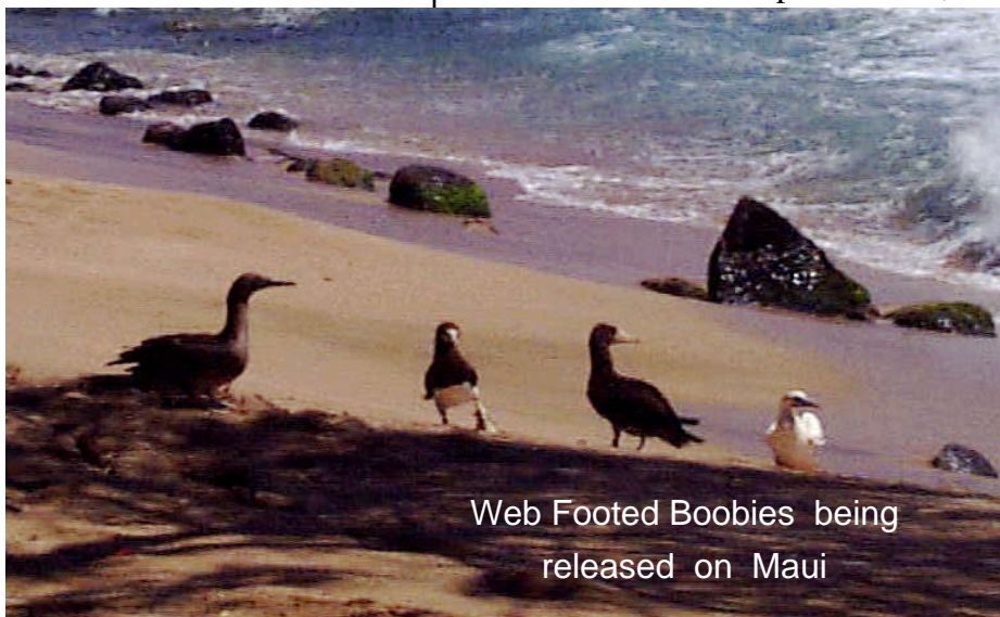
Web Footed Boobies being released on Maui

of three hose systems that connect to the Single Point Mooring at Tesoro's Hawaii Refinery, was leaking oil. All identifiable free floating oil was collected by the second day with no land impact on Oahu. However, some oil apparently was carried below the surface and showed up on Kauai two weeks later. Approximately 45 sea birds, primarily long distance Boobies, were oiled offshore and showed up back on the coastlines of several islands. These birds were collected and cleaned in the first organized Hawaii oiled wildlife response in many years. Tesoro, CIC, the State of Hawaii, IBRRC, Sea Life Park, USFW, and others worked together to clean and rehabilitate the birds. Over 30 birds were cleaned and released.